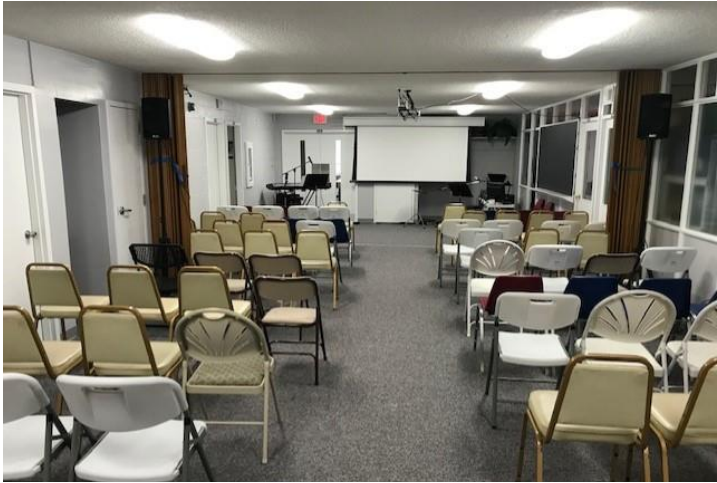
Our 2/3 rd Braddock Baptist Church Temporary Sanctuary

For Sunday Service, we are now partially reopening on the third floor for worship. The church renovation is in full swing and we are waiting expectantly to see our new sanctuary, fellowship hall, and lobby. Please be flexible in this time of transition and let us know if you have any questions. For those unable to do three flights of stairs, or unable to come due to being at high risk for Covid-19, you can also find our livestream on YouTube @ “Braddock Baptist Church.” Sunday School starts at 9:45am, and Service starts at 11:00am! We would love to see you every Sunday!